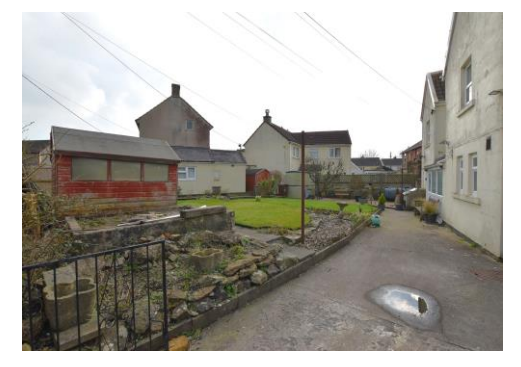
'A detached cottage, requiring renovation and updating but it conveniently located close to the village centre and its amenities!'

An interesting opportunity arises to purchase a three bedroom detached cottage which is ripe for updating and requires some renovation having been under the same ownership for almost 40 years. The property has an entrance porch providing handy storage options and this then leads into a spacious dining room with stairs to the first floor. There is a cosy lounge with open fireplace, kitchen/breakfast room and a rear lobby. The bathroom is located on the ground floor with a separate wc. On the first floor there are three double bedrooms. Double glazing and oil CH.